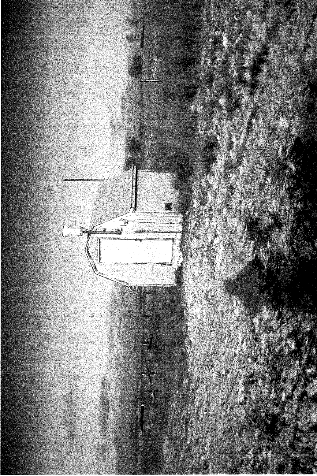
Figure 4. Gauge house for sampling water flow and quality on Marshall Ditch approximately one-half mile upstream of constructed wetlands site.