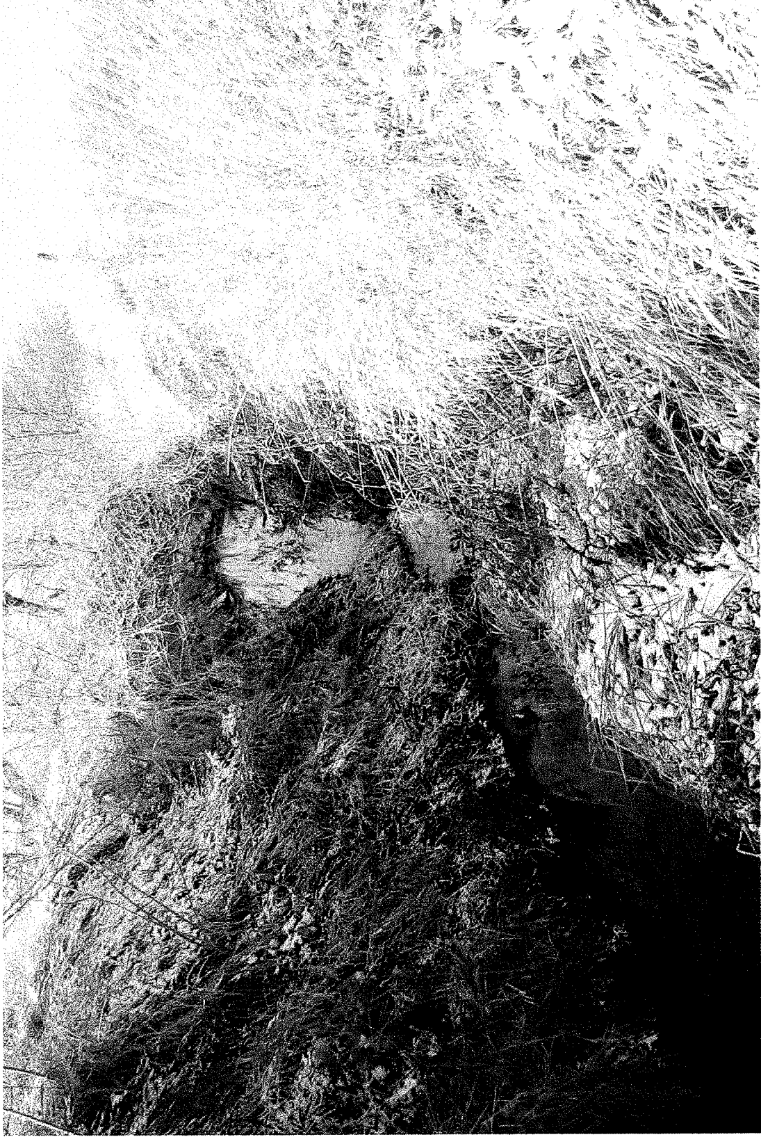
Figure 3. Marshall Ditch adjacent to the constructed wetland site in December 1999. Approximately 2000 acres of agricultural watershed drains to the ditch at this point.